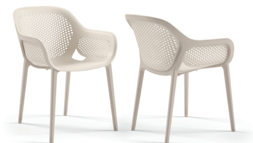
Warm Gray-S / Warm Gray-B 101014001