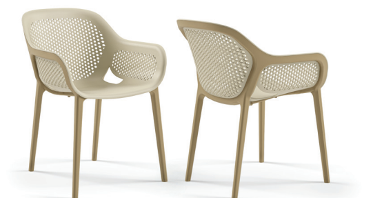
Beige-S / Coffee-B 101014006