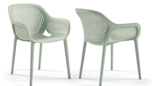
Nile Green-S / Nile Green-B 101014000