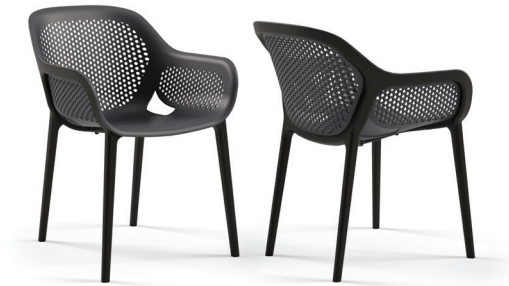
Anthracite-S / Black-B 101014003