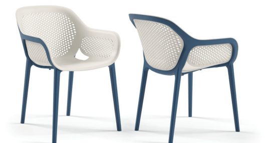
Cool Gray-S / Sax Blue-B 101014008