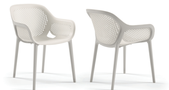
Cool Gray-S / Cool Gray-B 101014002